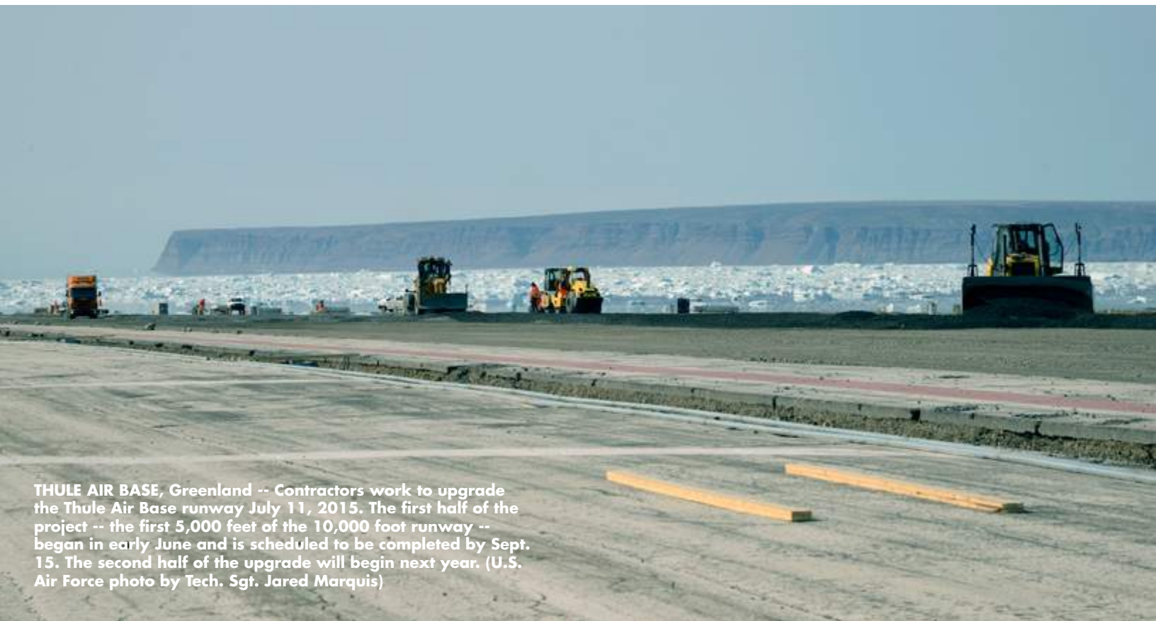
THULE AIR BASE, Greenland -- Contractors work to upgrade the Thule Air Base runway July 11, 2015. The first half of the project -- the first 5,000 feet of the 10,000 foot runway -- began in early June and is scheduled to be completed by Sept. 15. The second half of the upgrade will begin next year.