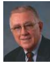
Carl Monismith Award Winner

12:00 p.m. – 1:30 p.m., Commonwealth B, C, D (2nd floor)